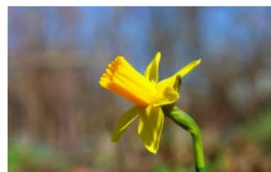
Danica Combrink 2018

Daffodils Are Flipping Flopping Over dirt In Lily's