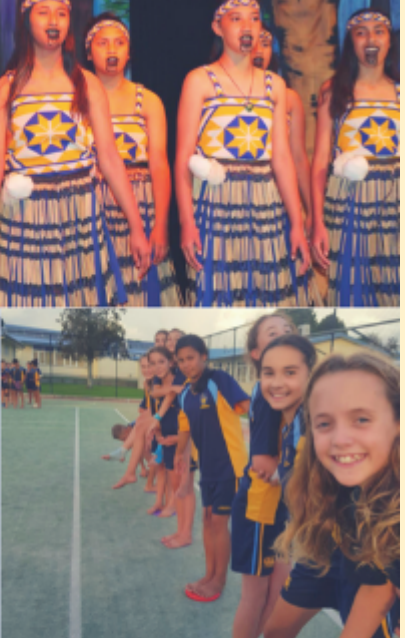
OPEN DAYS Wednesdays August 22 & 29 9am-2:30pm All welcome